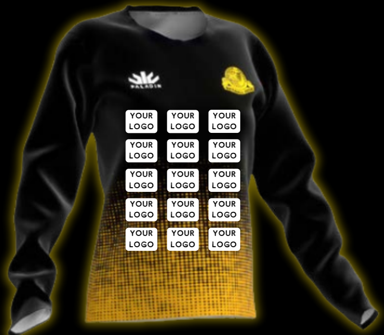
Front of L/S Shirt

*Design & exact logo placement to be confirmed. Example for illustrative purposes only