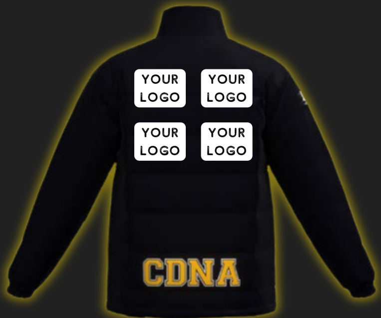
Back of Jacket

*Design & exact logo placement to be confirmed. Example for illustrative purposes only