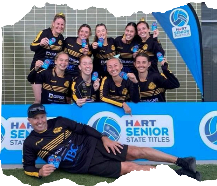
WINNERS! 2024 STATE TITLES OPENS ~ DIV 3