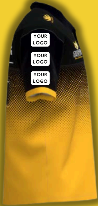
Sleeve of Polo Shirt