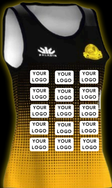
Front of Singlet