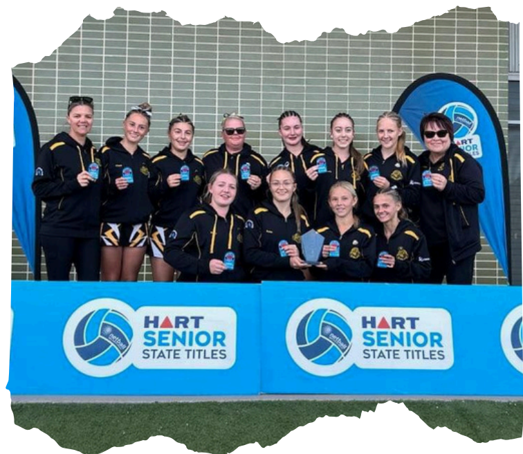
WINNERS! 2024 STATE TITLES 15'S ~ DIV 3

At Cessnock Netball we are open to any and all types of in-kind sponsorships, if you have something other than listed above in mind, we would love to hear your idea!