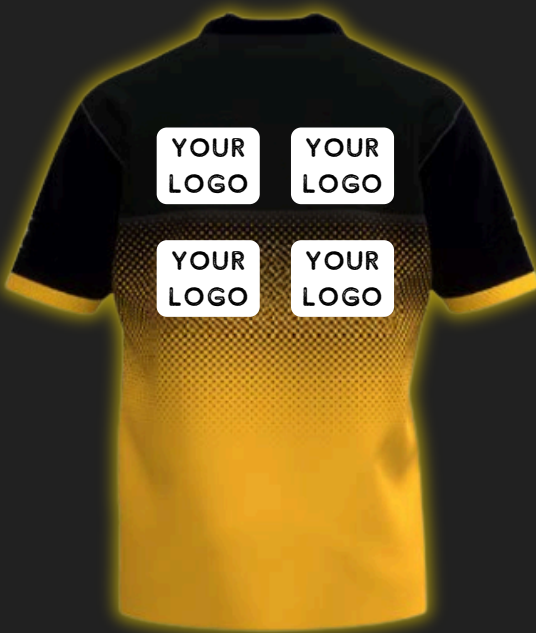
Back of Polo Shirt