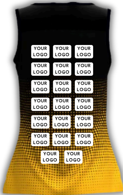
Back of Singlet